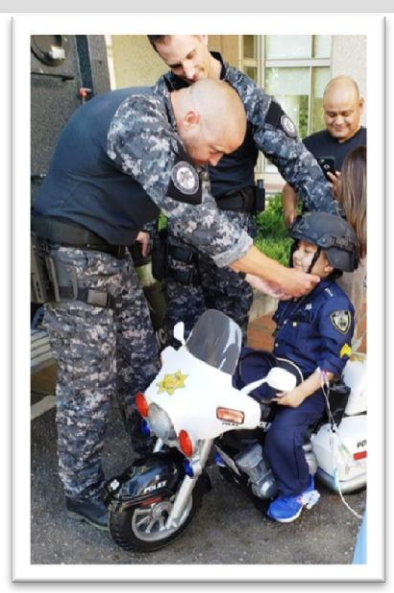
Make A Wish