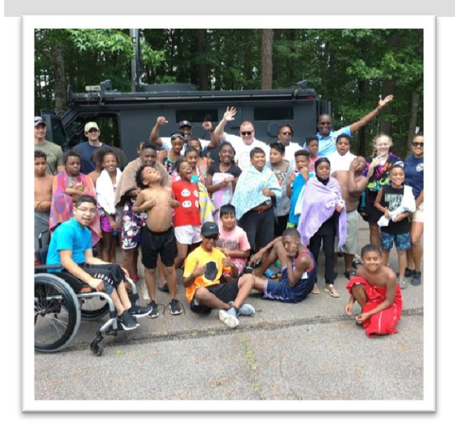
DPD Summer Camp