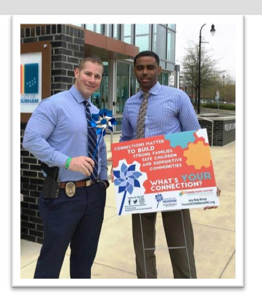
Child Abuse Prevention