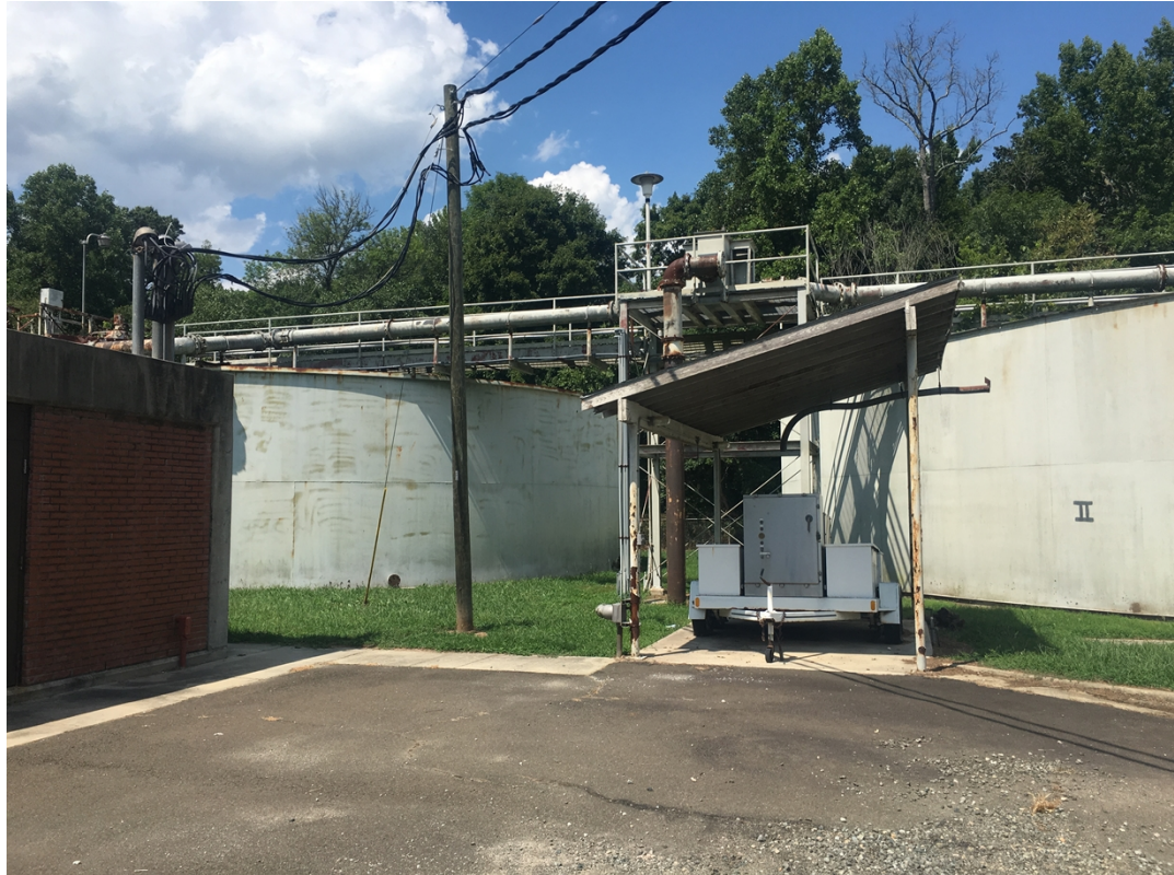
Photo 12: Tanks, shed and building to be demolished at Lick Creek WWTF