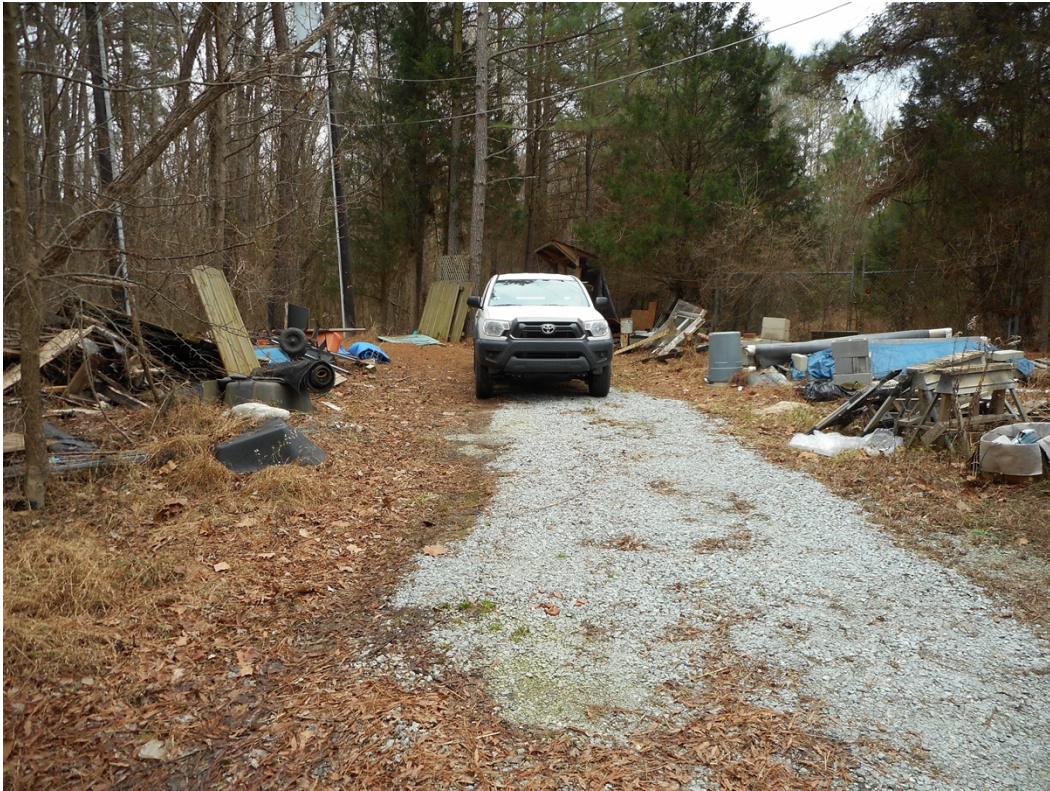
Photo 5: Illegal dumping outside the gate, fence, and along the drive at Farrington Rd. WWTF