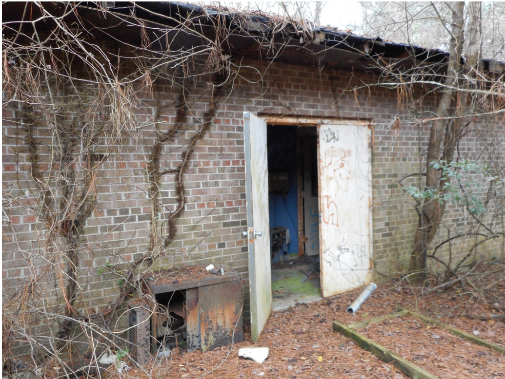
Photo 4: Heavily vandalized building to be demolished at Farrington Rd. WWTF