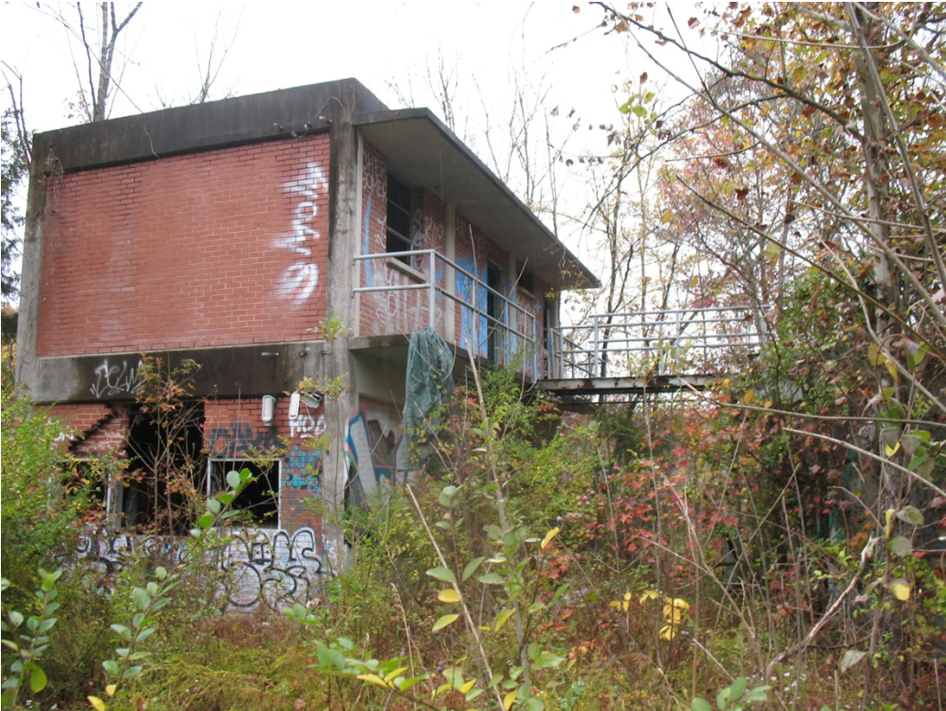
Photo 1: Heavily vandalized 2-story building to be demolished at Hope Valley WWTF.