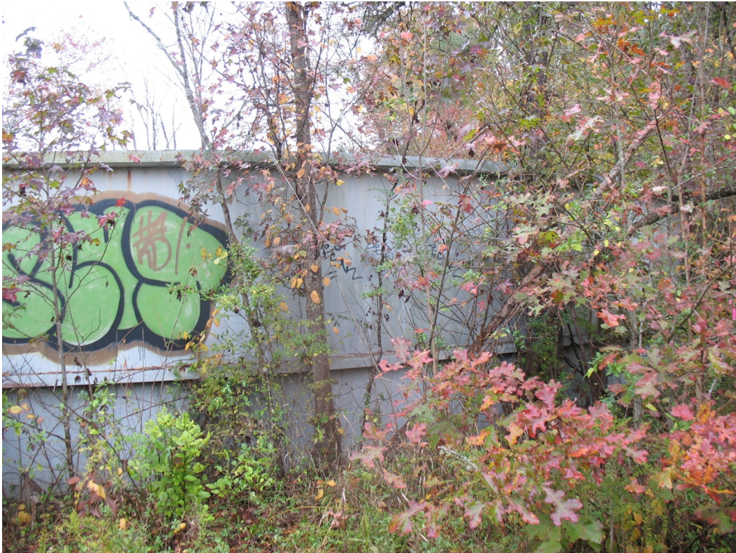
Photo 3: Vandalized steel package plant tank to be demolished at Hope Valley WWTF